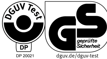
Approved design for a height of 20 mm or less: